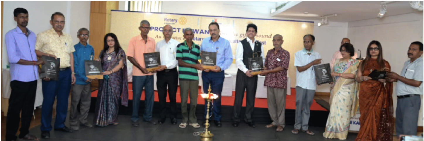
Symbolic handover of Hearing Aids to the beneficiaries.