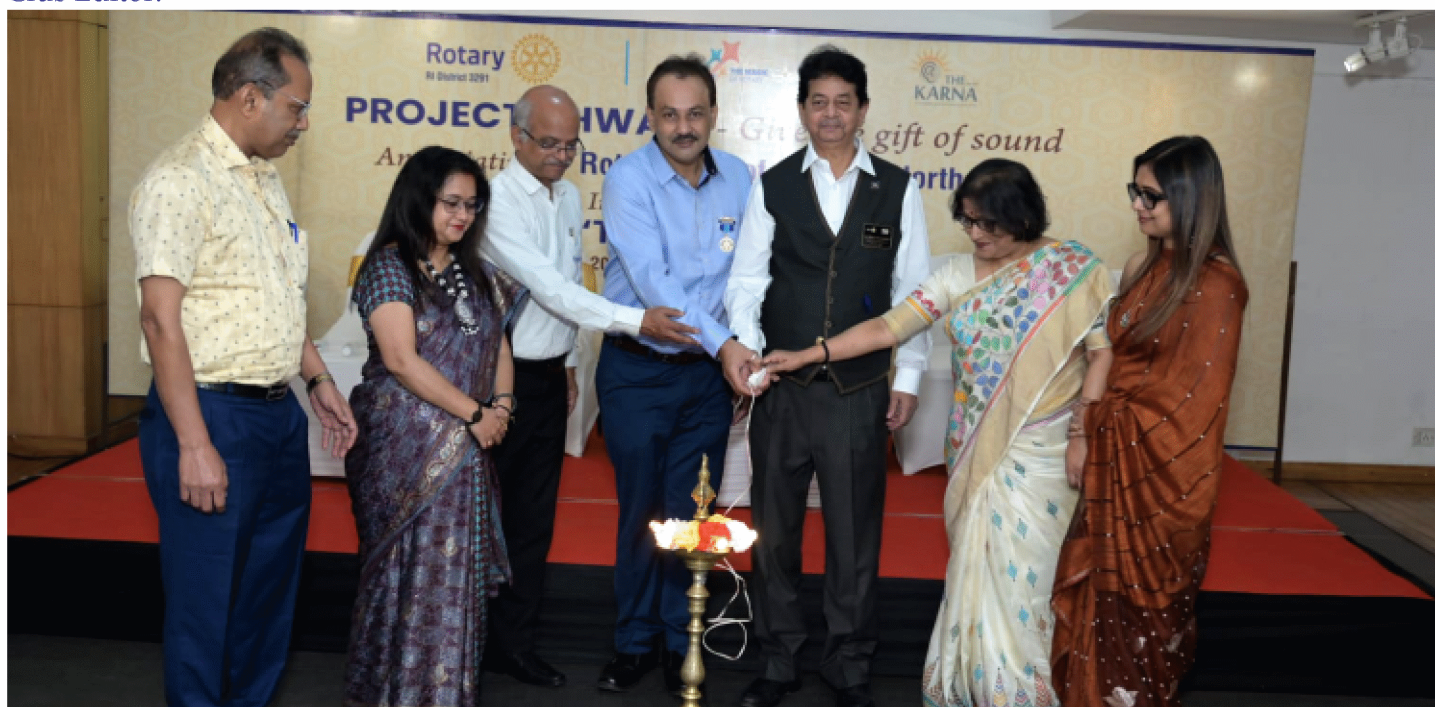
Launch of Project Dhvani