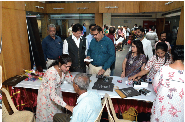
Distribution counter of Hearing Aids