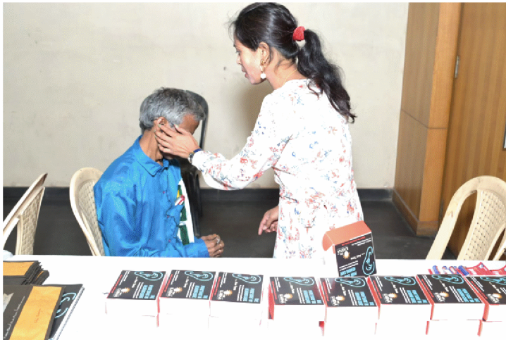
Hearing Aid fitment done by The Karna